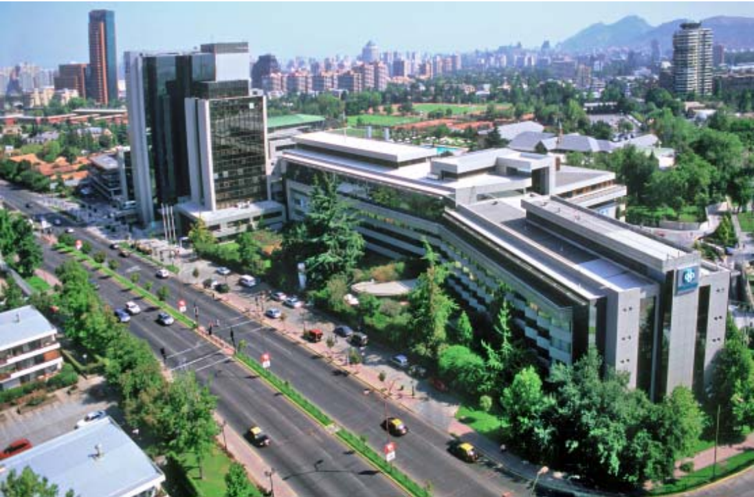
Above: An aerial view of Clinica Alemana - the towering Marriott Hotel can be seen in the background.