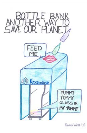
Gemma's winning poster.

units are still awaiting modifications but the larger unit behind the Town Hall is now operational, "...and we have our first consignment of cullet heading out to the Stanley Dairy where it will be used within their heat sinks."