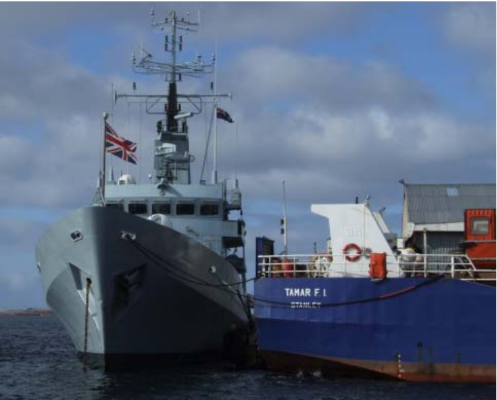
Above: Dumbarton Castle alongside the East Jetty in Stanley at the weekend.

In the last few months of her time in the Falkland Islands, HMS Dumbarton Castle's crew have been preparing for their journey home to Port-