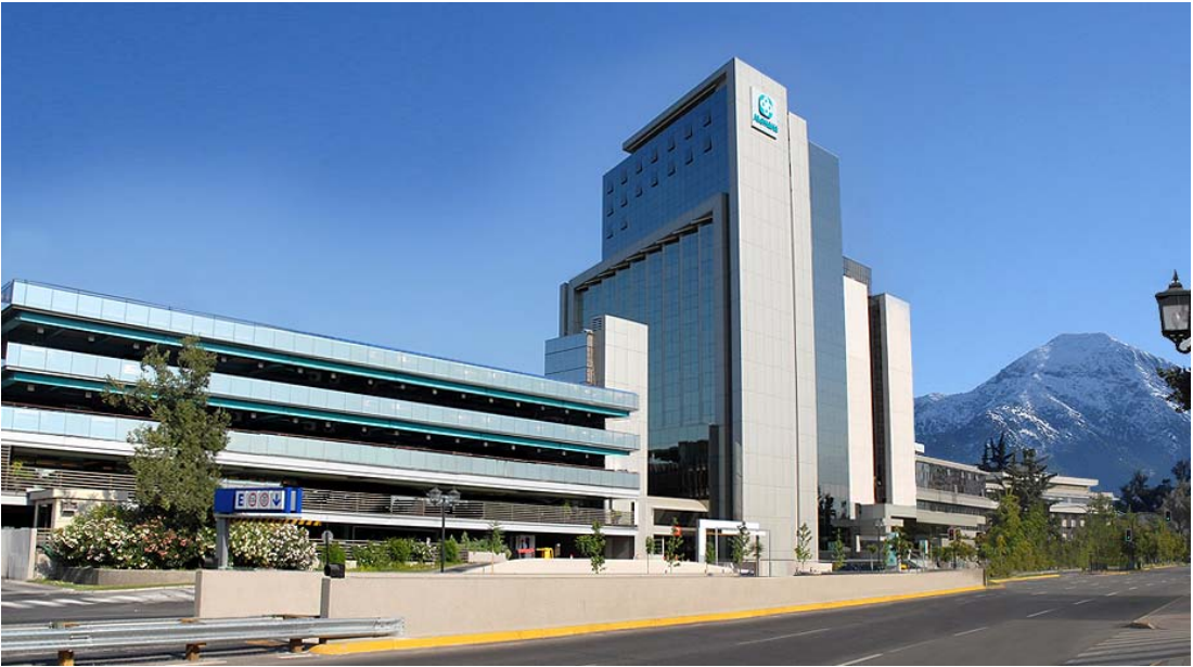
The Clinic, pictured from Avenida Manquehue Norte.