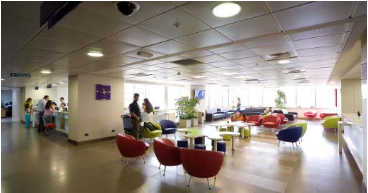
One of the hospital waiting rooms

(Click on the Union Flag for the English version of the site.)