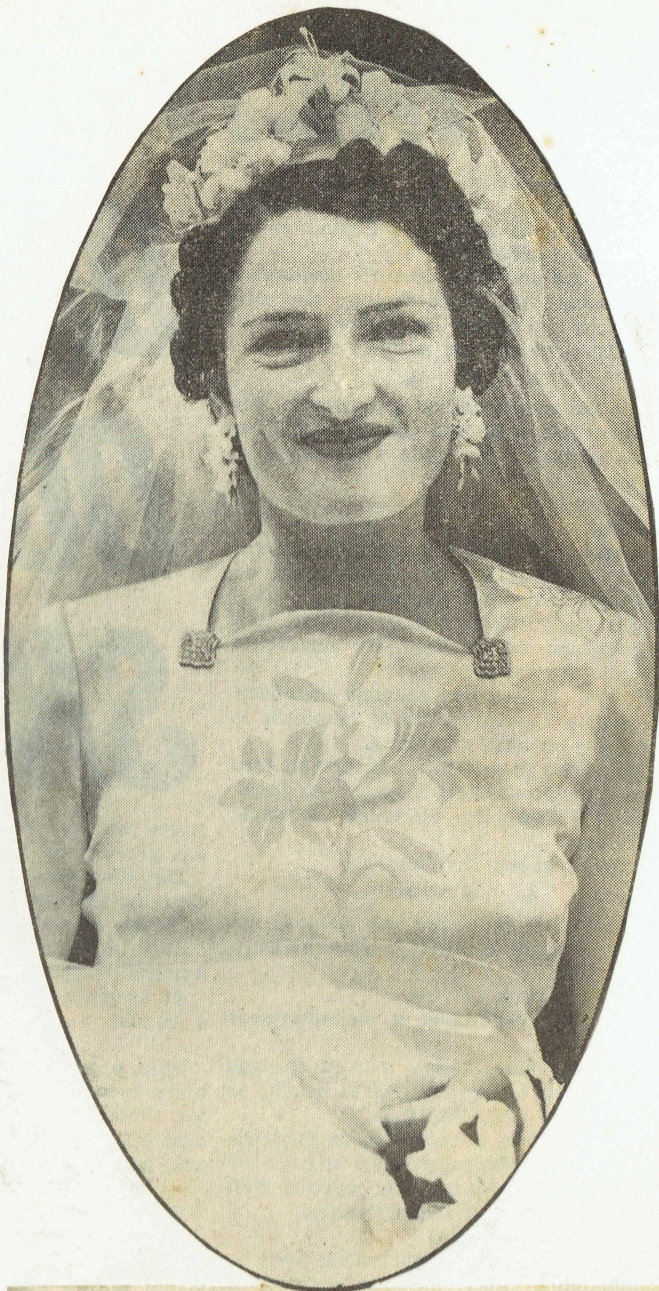
THE BRIDE WORE EAR-DROPS OF REAL JASMINE FLOWERS.