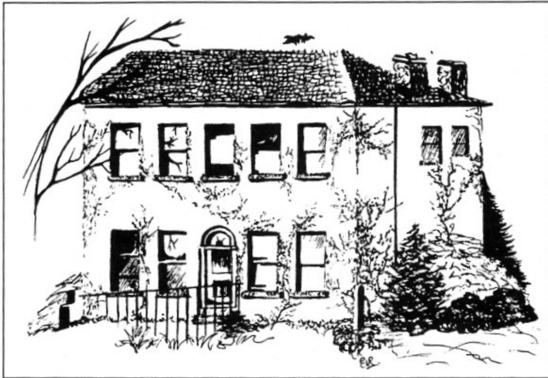
A sketch of Islandderry House. (F.G.)

Alexander Waddell built Islandderry House on the site of a rath overlooking the surrounding countryside, across the Lagan, as far as the Mournes.